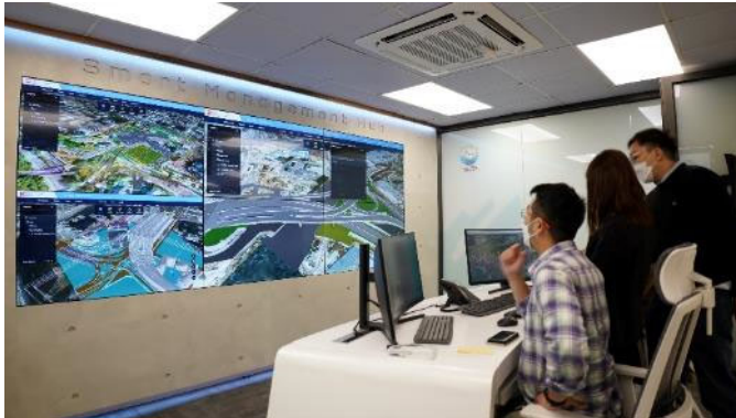
BIM and CDE Platform