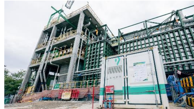
Green and Safety Innovations 綠色及安全創新方案