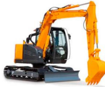
Smart and Alternative Fuel Machinery 智能及新能源機械