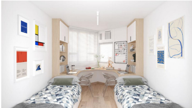
Mockup of MiC Modules for Various Purposes 真實比例「組裝合成」( MiC ) 模組