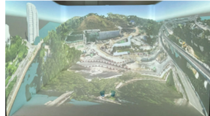
Virtual and Mixed Reality, Immersive Experience