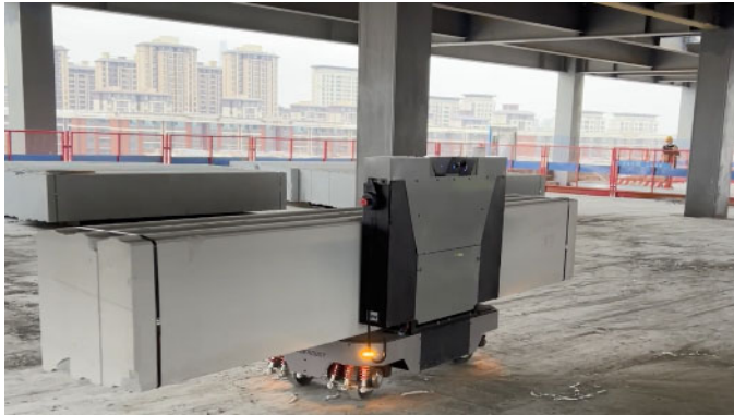
AI and Robotics 人工智能、機械人