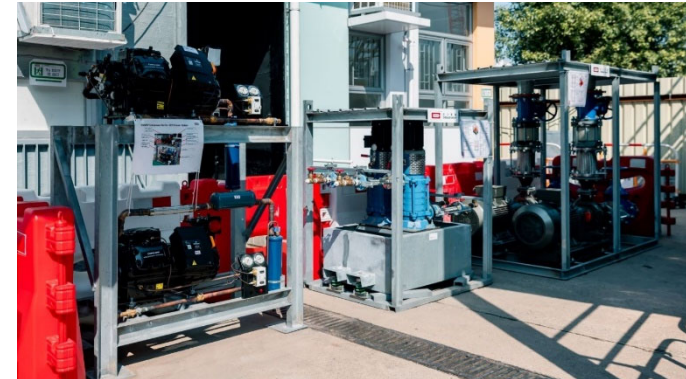
MiMEP and Mi Technologies 機電裝備合成法及「組裝科技」