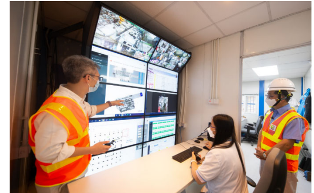
Smart Management System 智能管理系統